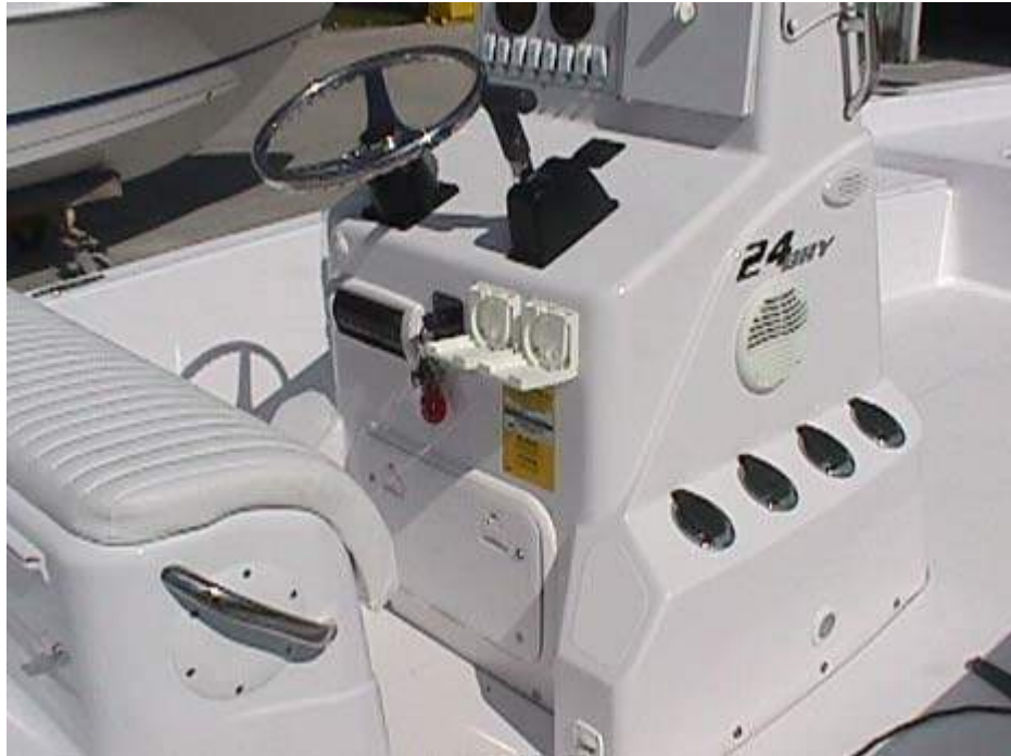
Fig 1 helm