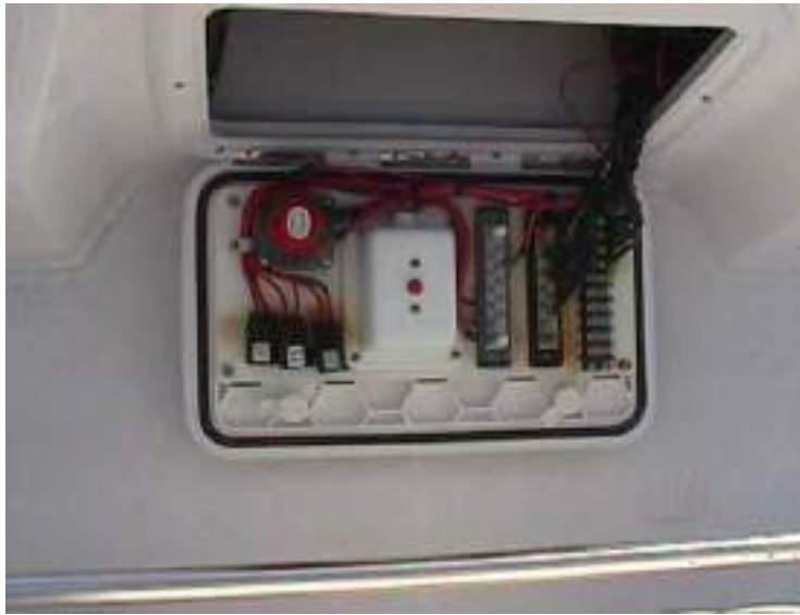
Fig 2 helm panel