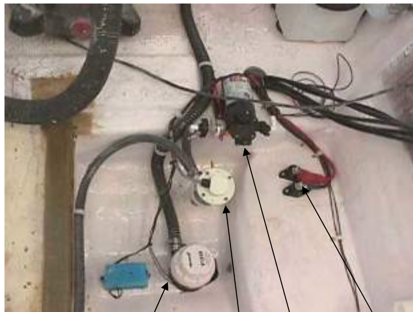
Bilge pump baitwell pump washdown pump engine posts

The bait-well switch controls a pump mounted on a seacock in the bilge. An overflow tube is provided that is inserted into the drain to allow circulation to keep bait alive. The wash down pump is mounted just above the bilge pump in the bilge. The pump is equipped with a pressure switch. Turn the main switch off if the pump is not going to be used soon. Raw water is taken in by the thruhull fitting with a seacock. A strainer on the pump filters the raw water. The filter must be cleaned as needed to avoid pump damage. Seacocks on all below water line fittings should be closed when not in use.